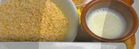
#25 DON JULIO DESAYUNO