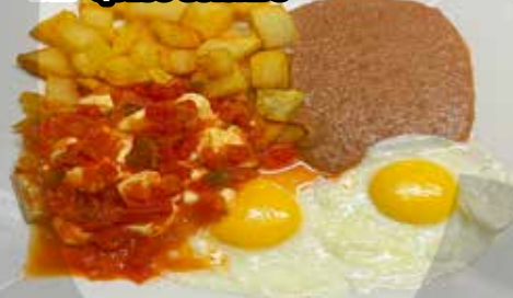
#27 QUESO GUISADO